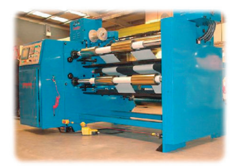
Slitting and Rewinding Holographic Films, H.S. Foils, TTR Ribbons.