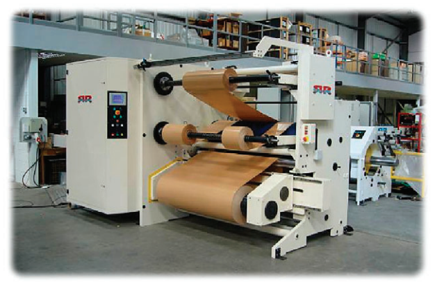
BESPOKE SLITTER APPLICATIONS Coated Aluminium Foils, Brass & Copper Alloys, Prepreg and Laminates, Ultrasonic tape slitting.